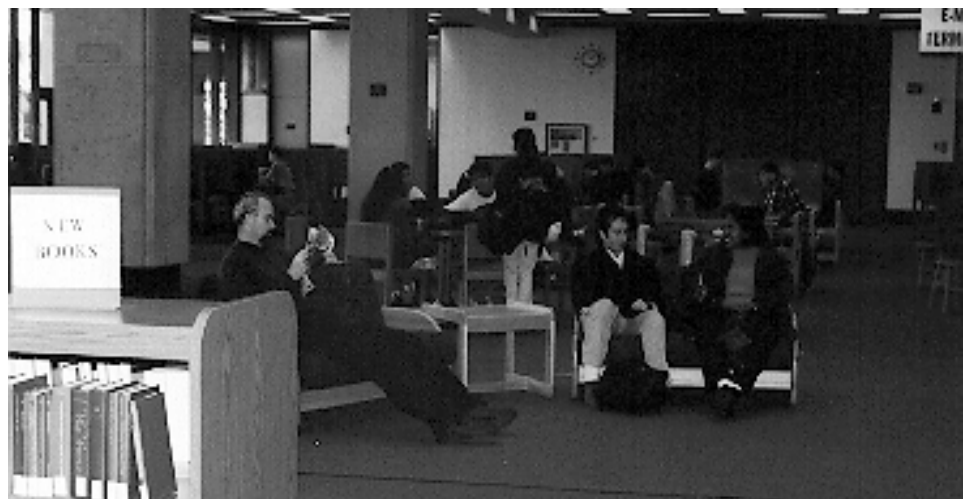
Cleveland State University students taking advantage of the University Library's 1st floor study area.