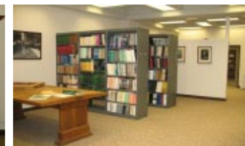
Just beyond the vestibule, visitors will find records, publications, audio-visual materials, and artifacts pertinent to CSU history and development, some of which are pictured here.