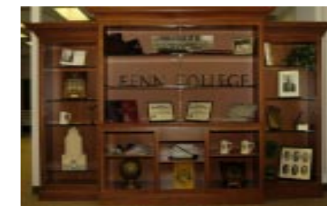
One of two custom-designed cherry wood display cabinets that were donated by Pi Sigma Tau Alpha members (located in the vestibule of Archives).

Visitors to the Archives will be able to find Fenn College and CSU catalogs, yearbooks, newspapers, photographs, and memorabilia, as well as being able to purchase copies of the book, Fenn College , published by the University Library.